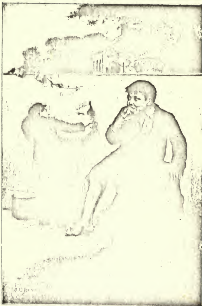
TOM GAVE UP THE BRUSH